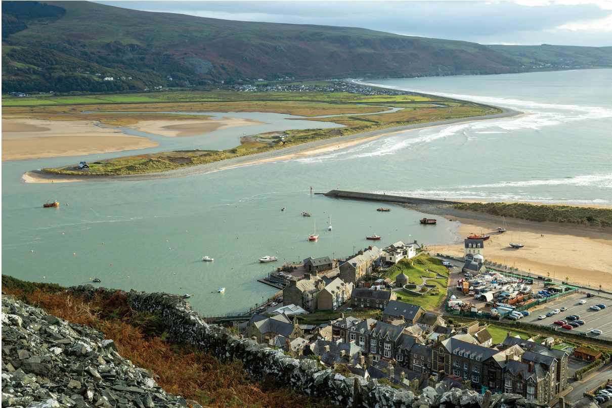
Fig. 1 – Coastal landscape in Wales