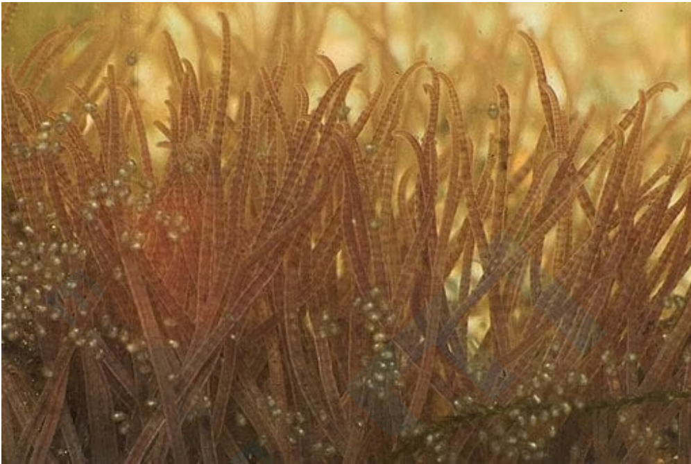
Tubifex worms are able to withstand quite polluted water