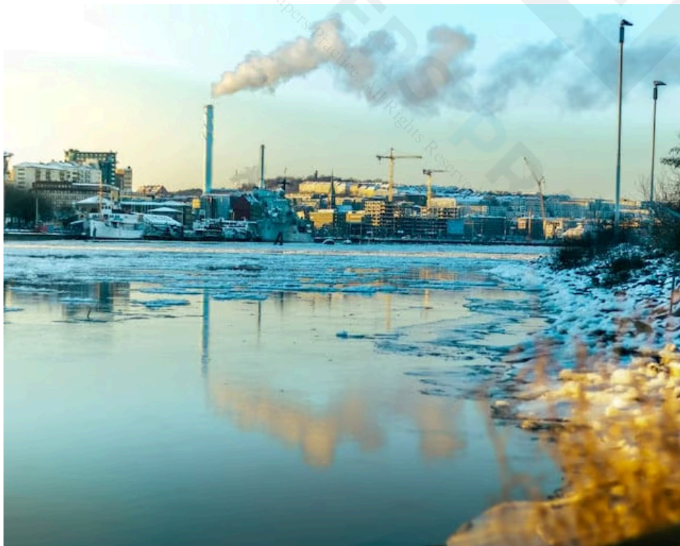
Measuring water pollution parameters near factory outlets is vital to assessing the impact on ecosystems