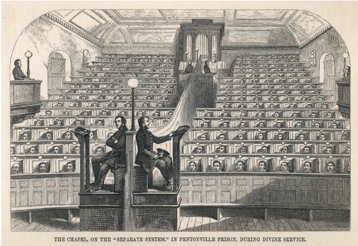
A drawing of prisoners in the chapel of a prison in London, 1862.