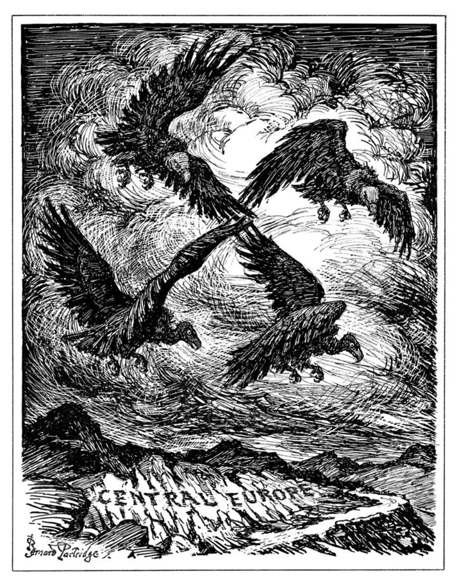
THE GATHERING OF THE VULTURES

A cartoon published in Britain on 22 March 1939.