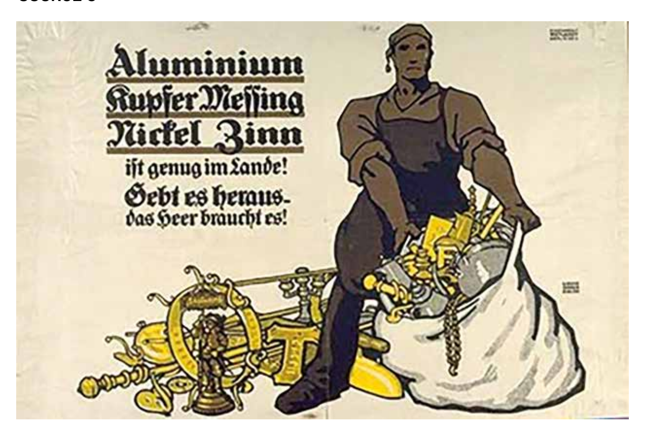
A German poster published in 1918. The words say 'There is enough aluminium, copper, brass, nickel in the country! Hand it over – the army needs it!'