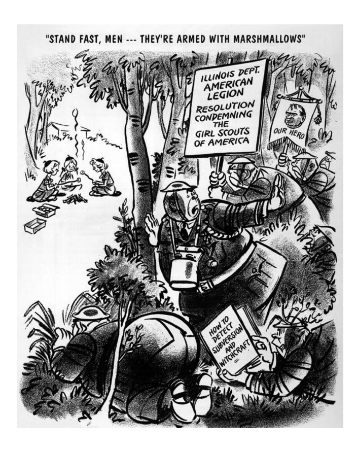
A cartoon published in America in 1954.