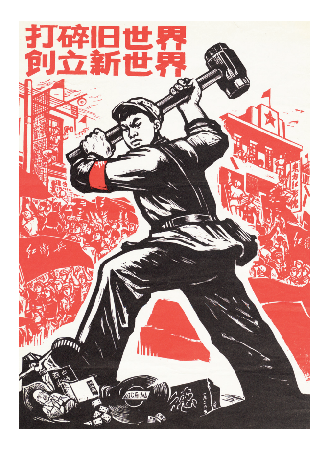
A poster produced by the Chinese government in 1967. The writing at the top of the poster says 'Destroy the old world, build a new world.'