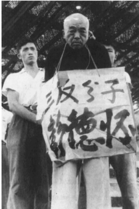
A photograph of Peng Dehuai, who was brought to Beijing in chains by Red Guards, in 1967. He had been a senior military leader and politician.