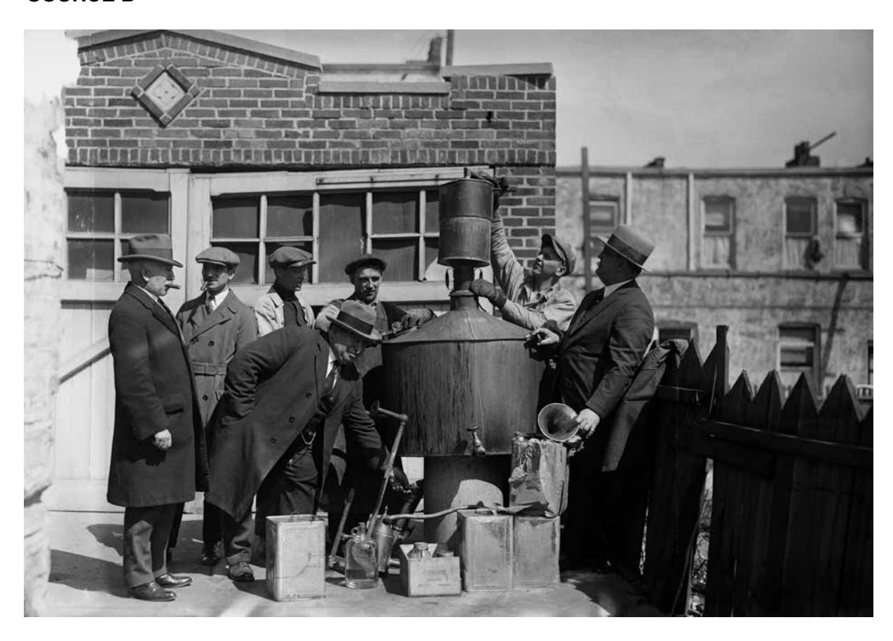
A photograph of Izzy and Moe and other Prohibition Agents, published after a raid in 1925.