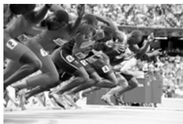
Start of 100m race