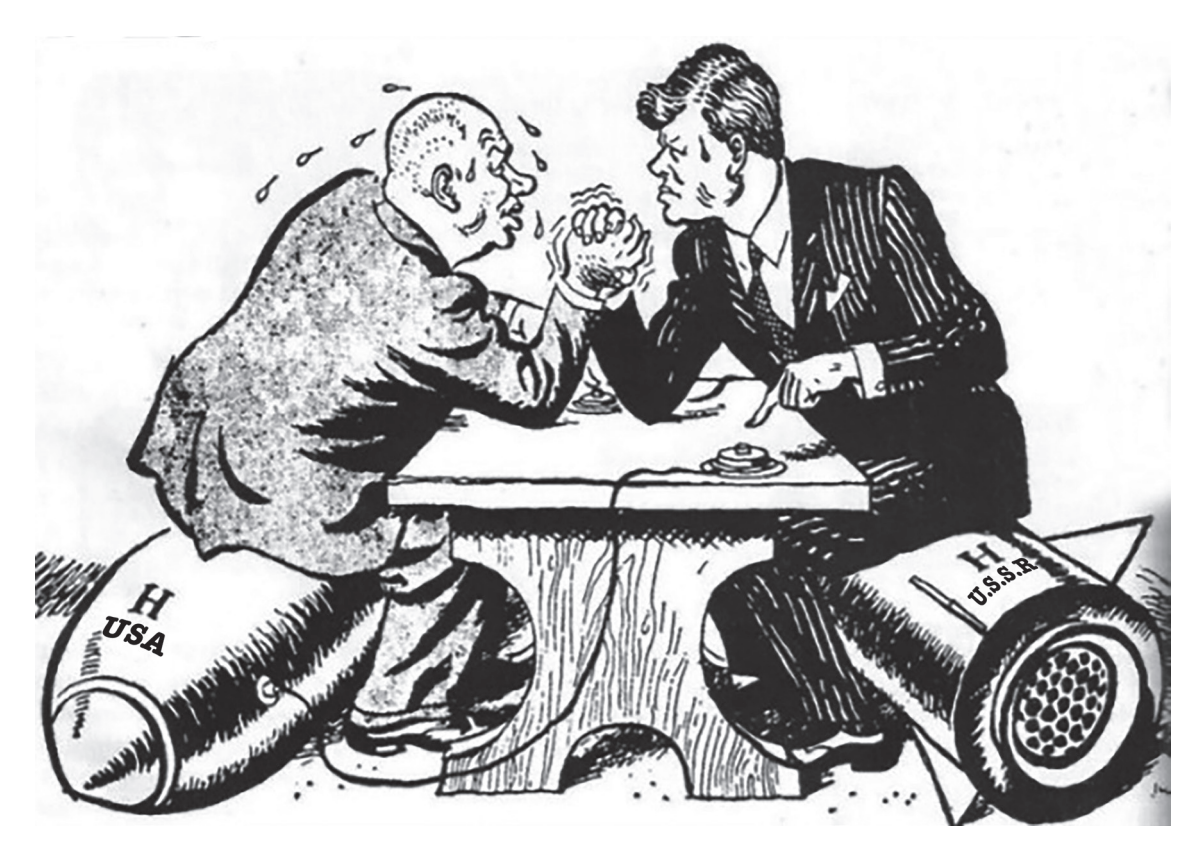
A cartoon published in a British newspaper, 29 October 1962. The caption reads, 'OK, Mr President, let's talk.'